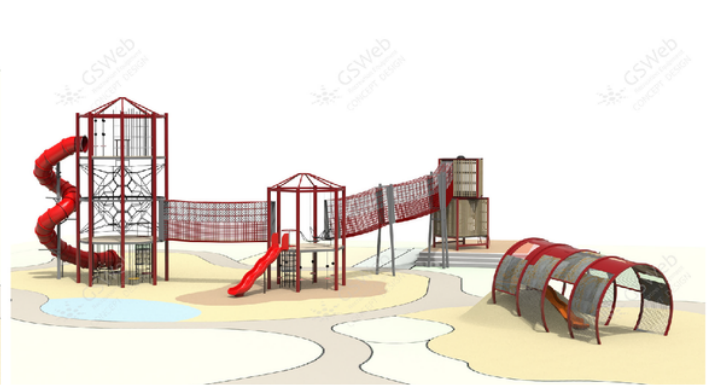
Internal view looking east Internal play equipment is indicative only and will be developed through the design process.